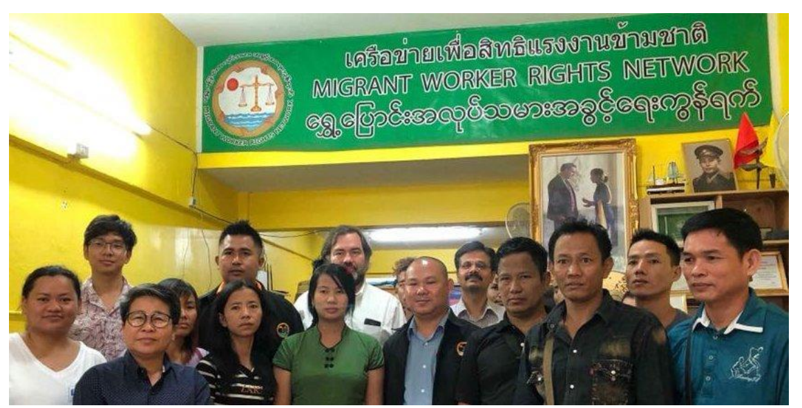
Photo: former Thammakaset workers and MWRN staff meeting with UN Working Group on BHR

On 10 September 2017, Human Rights Now (HRN) conducted interviews with the 14 former Thammakaset Farm 2 workers over Skype with the assistance of a staff member of Migrant Workers Rights Network (MWRN) which assembled the workers for the interview and assisted with translation. The 14 workers consisted of 6 females and 8 males, aged between 18 and 52 (in 2016 at the time of the initial dispute). Thirteen were ethnically Burmese and one was Arakan. All spoke Burmese; only two spoke a little Thai. 85