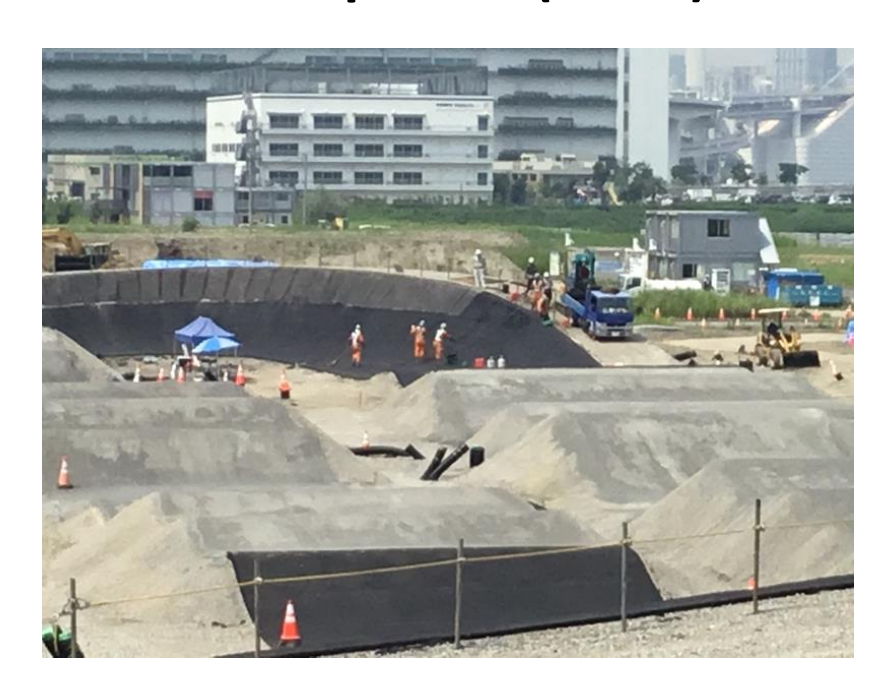
An investigation by International Human Rights NGO Human Rights Now