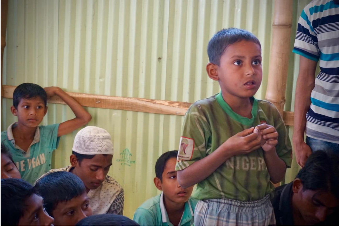
Photo 4: “They slit my mother’s throat in front of me,” a young boy testifies.

Male & female, ages 4-15 20 (children), age unknown (schoolteacher), Kutupalong & Balukhali