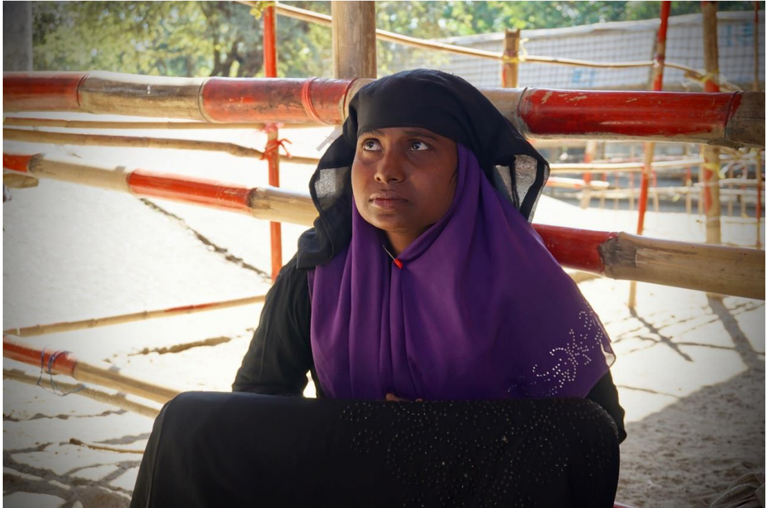
Photo 2: A young woman who was separated from her remaining living family members when her village was attacked.

Furthermore, a boy cooking in a Kutupalong snack shop told HRN that his brother and father had both been killed in Myanmar, and that his entire village and house were burned. He was prevented from going to school, and escaped in the night with his mother and three sisters, but with no money.