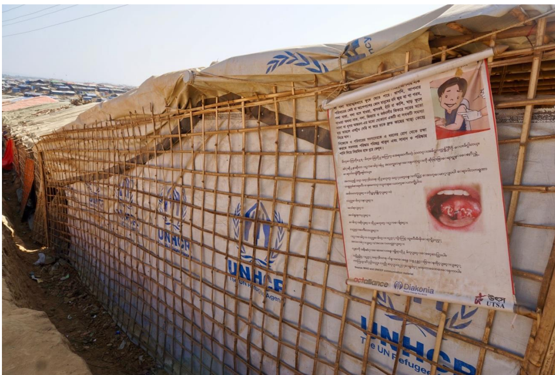
Photo 6: Various diseases are rife and easily communicable in the camps.

Several organizations, including the International Office for Migration (IOM), Oxfam, and Doctors Without Borders, were also combatting diphtheria and cholera epidemics. A representative from a clinic operated by the health sector of the IOM said that the clinic received about 30 to 40 patients a day; roughly half were cases of diphtheria, and half suffering from other respiratory tract infections. As diphtheria is a communicable disease, it spreads quickly within families and is easily transmittable in the densely populated camps. Furthermore, two representatives from Oxfam cited their primary activities included providing education sessions about diphtheria, cholera, and other water-born diseases, as well as proper hand washing technique, to help combat the spread of the illnesses.