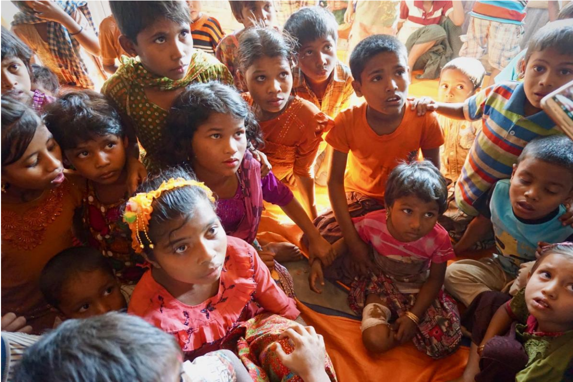
Photo 3: Students surround a young refugee who witnessed her father being shot and was also shot in the leg.

A man recounted a similar situation. He escaped on foot with his family after the military looted and burned houses and shot villagers. They had to flee through the mountains during the rainy season, and could not take anything with them, including food or rain cover.