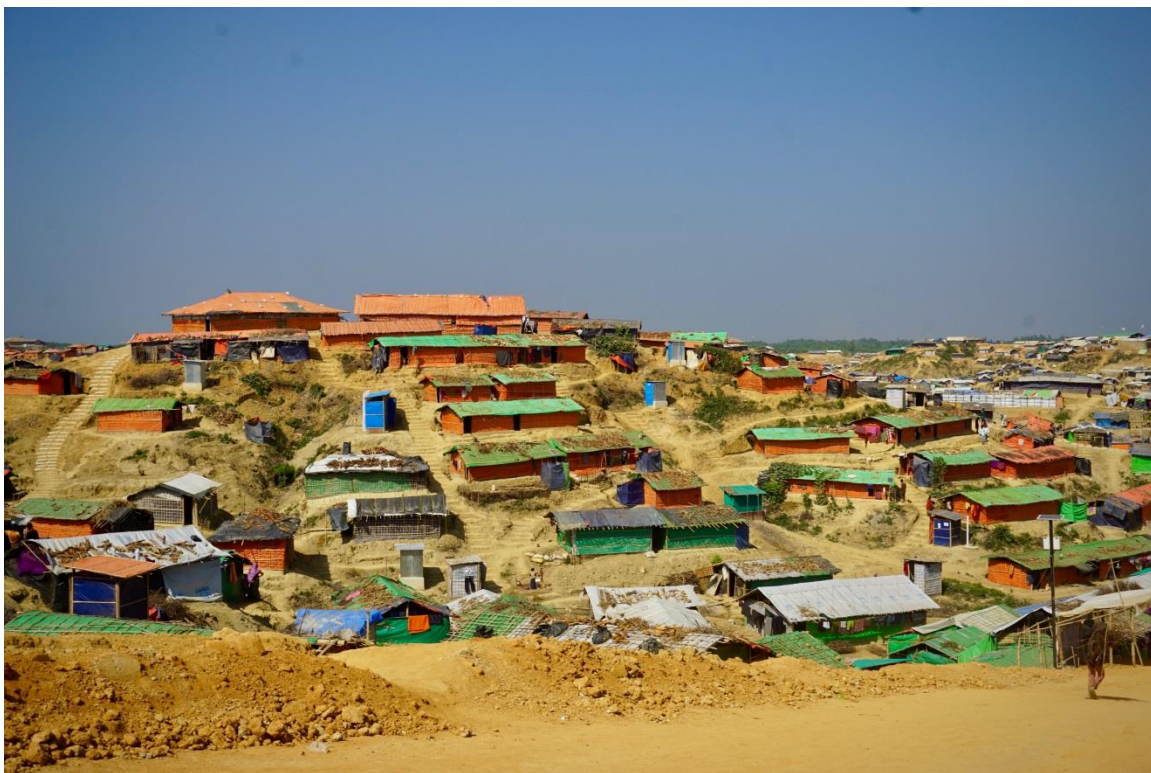
Photo 10: The camps were previously jungle, and are prone to various natural disasters, including landslides and flooding.

Environmental conditions make the camps prone to natural disasters. The area of much of the camps used to be jungle, but more and more trees were cut down to create temporary housing. Some Rohingya resort to entering the jungles to illegally cut trees, which they then sell to earn money. This creates a variety of environmental concerns. Much of the camps are in danger of landslides and flooding from monsoons and typhoons. The dry season could see rise to more fires, according to a spokesperson from the Adventist Development and Relief Agency (ADRA), which would spread quickly in the densely packed camps of wooden housing. The camps have furthermore destroyed the living environment and blocked the space where elephants often roamed, leading elephants to sometimes enter into the camps; while HRN was in Cox's Bazar, one man was killed and a woman's face crushed after an elephant entered their house.