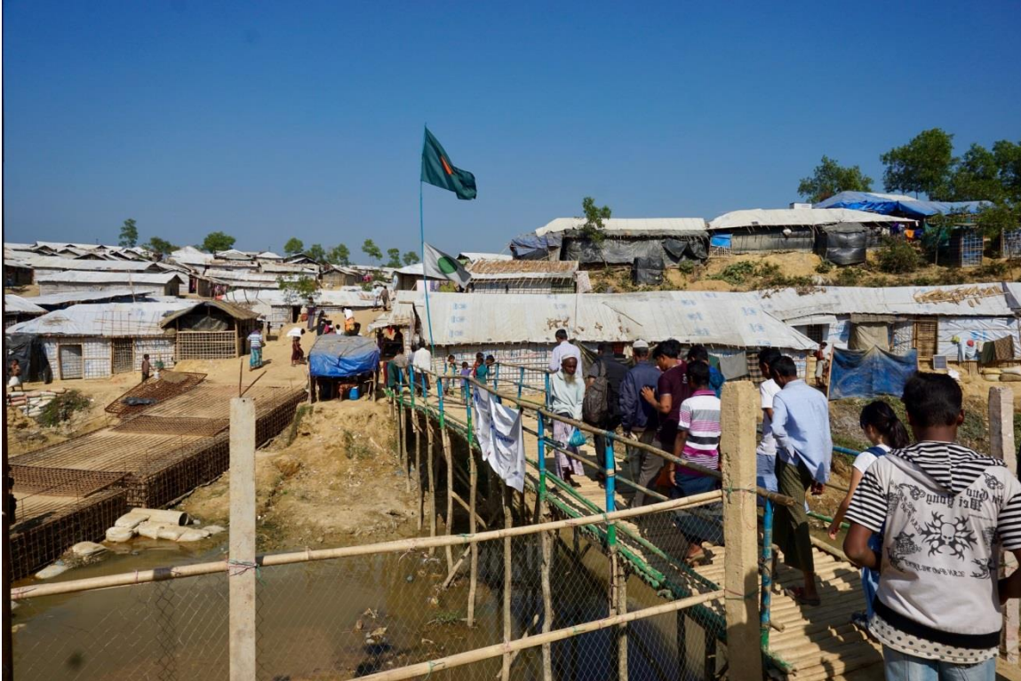
Photo 7: Despite efforts, there are still many sanitation issues in the camps.

Many Rohingya suffer from psychological issues as well. The spokesperson for the Mental Health Service Centre run by the Multi-Sectoral Programme on Violence Against Women (see IV.a.i) cited depression, PTSD, and anxiety disorders to be common. Sufficient awareness about mental health is also lacking. The spokesperson stated that when the patients first arrived, they had serious trauma, but months later they begin having anxiety from day-to-day issues, housing concerns, or a lack of rations, nutrition, or money. Boredom from being unable to work or go to school causes mental strain on many refugees interviewed by HRN. The 55-year-old female refugee (see IV.a.i) stated, “I feel I am just existing here. If it were for a short period, it would be fine, but we won't be able to go home soon. I don't know how to continue living here.”