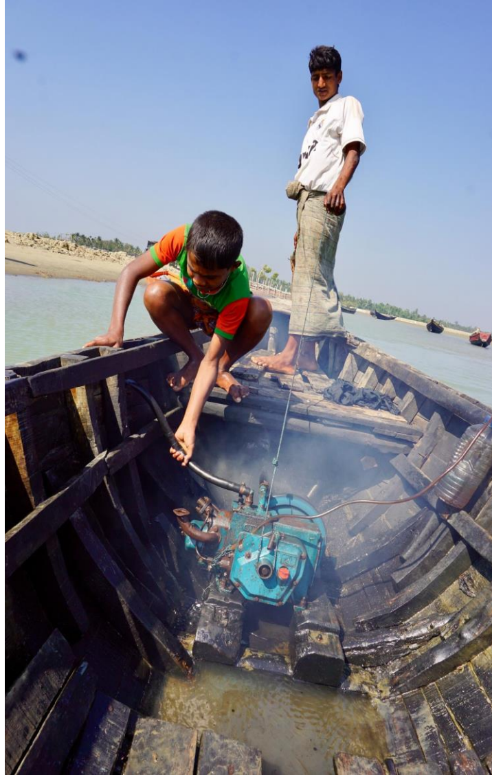
Photo 5: A boat of a fisherman like the ones used to help refugees cross the Naf River.