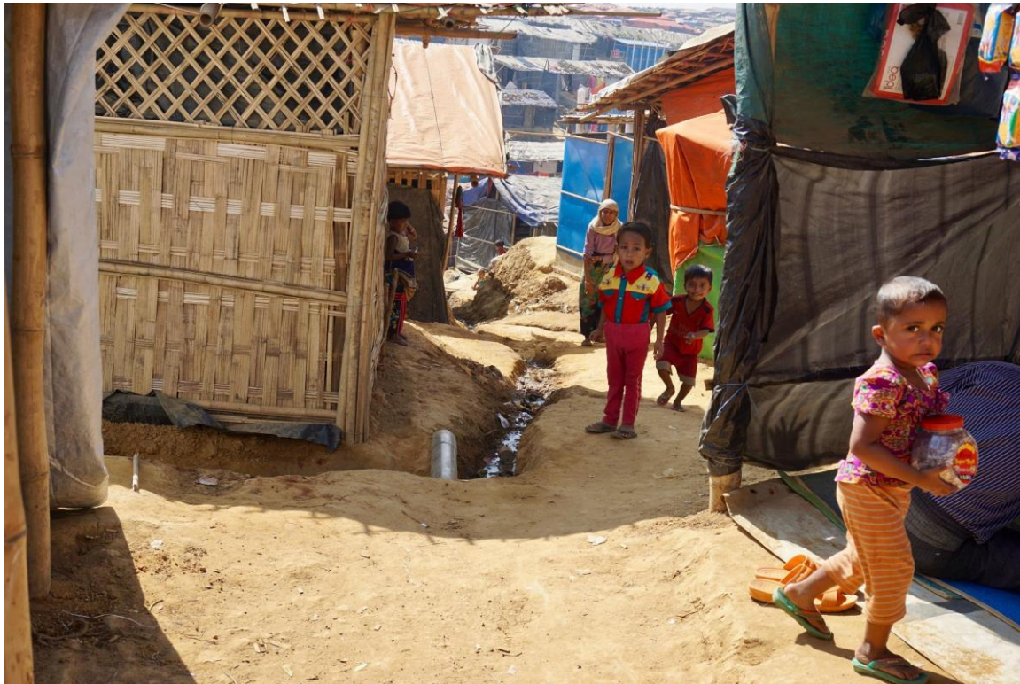
Photo 8: Population density is a serious concern in the refugee camps.

required the entire Rohingya refugee community to be conscious of proper hygiene maintenance.